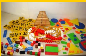
Jodo Gyan- Math Learning Material