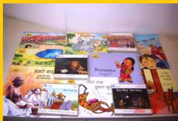
Library Books and CDs